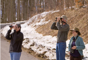
2010 Burke's Garden Trip

Nestled atop Garden Mountain at an elevation of 3,000 feet, Burke's Garden is Virginia's highest valley and completely encircled by mountains. This area is an amazing birding spot