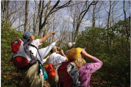
A Wilson Creek IBA field trip in 2008.

PO Box 3746 Boone, NC 28607 http://www.geocities.com/hcaudubon E-mail: highcountrybirder@yahoo.com