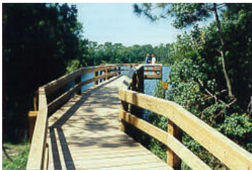
Boardwalk to Gaillard Lake

The 164 acres include the widest possible range of habitat from a fresh water lake, Gulf beaches, swamp, pine forest, dune system and hardwood clearings.