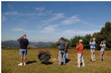
HCAS group at Mahogany Rock in 2007

The official count will be posted online daily at www.hawkcount.org . Click on North Carolina and scan for the Mahogany Rock section.