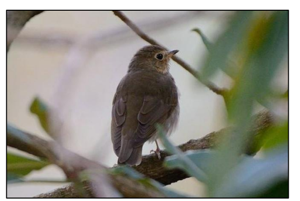
Swainson's Thrush, 28 Oct 2018, Boone Greenway Trail, Watauga. Photo by R. Gray.