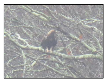
Adult Golden Eagle at the New River CBC on 4 January 2019.

December 14- Mt. Jefferson: Rainy day birding with 4 parties in Ashe County produced no unusual finds, but one of the highest counts of Red-breasted Nuthatches in the area this year, 8, all along the New River.