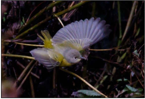
Nashville Warbler, 30 September 2018, Half Moon Overlook, Grandfather Mountain, Avery County.