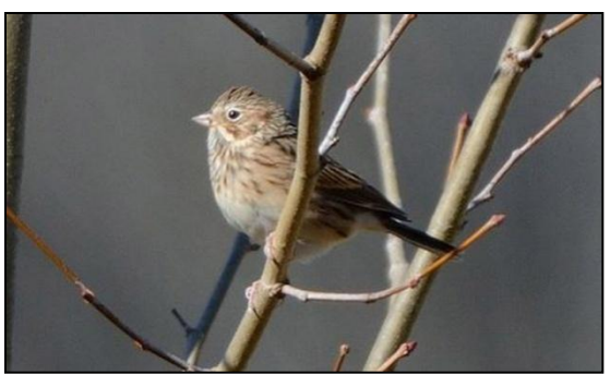
Vesper Sparrow, 4 November 2018, Valle Crucis Community Park, Watauga County.

Red Crossbill , a flock of 5 at Elk Mountain Overlook on the BRP on 26 Sep stayed in the Deep Gap area thru 10/31