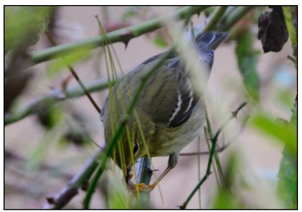
Blackpoll Warbler, 28 October 2018, Boone Greenway Trail, Watauga County.