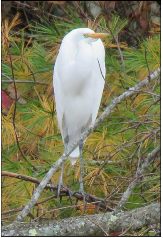
Great Egret, 6 November 2018, Hickory Knoll Neighborhood Watauga County.

Mississippi Kite , MAHOG on 22 Sep and 8 Oct Northern Harrier , 1 at Osborn Mountain Overlook on the BRP in Watauga on 29 Sep, and 1 at VCCP on 22 Nov. Hawkwatch season totals: GRANDFATHER-4, MAHOG-3