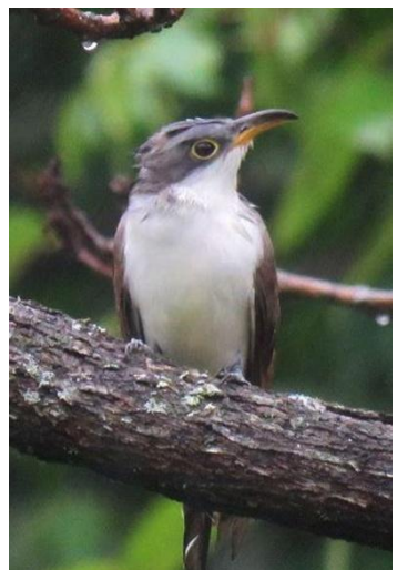
Yellow-billed Cuckoo, 17 Sep 2018, Boone Greenway Trail, Watauga County.