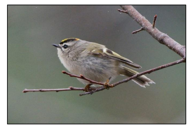
Golden-crowned Kinglet, 23 November 2018, Boone Greenway Trail, Watauga.