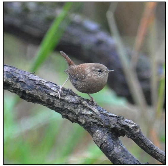
Winter Wren, 13 November 2018, Valle Crucis Community Park, Watauga County.