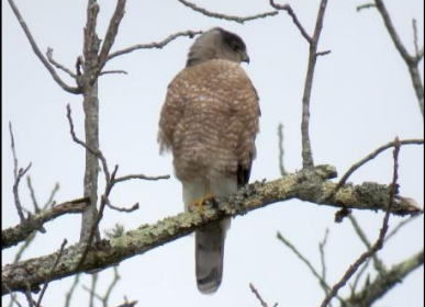
Adult Cooper's Hawk at the Shady Valley/ Mountain City CBC on 1 January 2019.