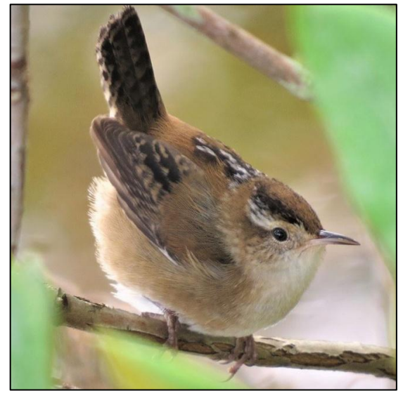
Marsh Wren, 29 Sep 2018, Julian Price Memorial Park--Price Lake, Watauga.