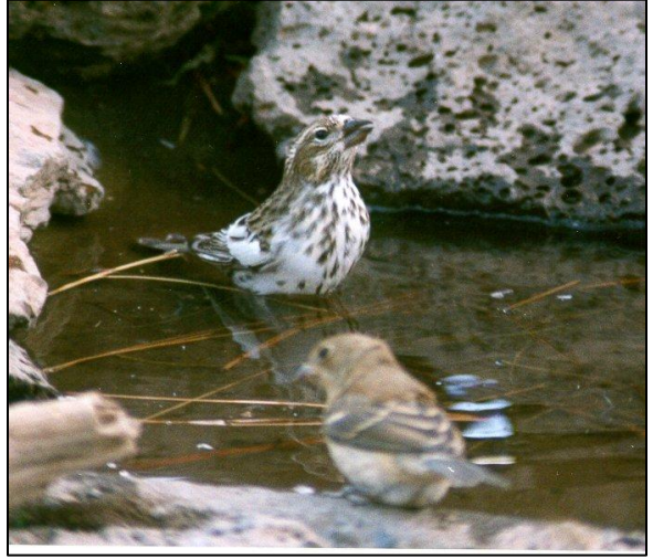
This aberrant female or hatch-year male Cassin's Finch displays a very broad white wing bar not unlike the wing bar on a female Lark Bunting. The bird lacks the black malar stripe and clean white throat stripe typical for a female Lark Bunting. 15 September 1998, Cabin Lake Ranger Station, Lake County, Oregon

very rare bird in Oregon. It was drinking from a man-made dripper in front of a very well-known photography blind in a ponderosa pine forest, where Cassin's Finches were swarming by the dozens.