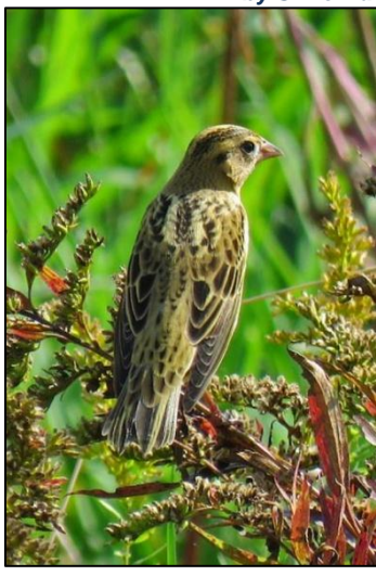
Bobolink, 6 Oct 2018, Brookshire Park--Loop and Greenway, Watauga County..