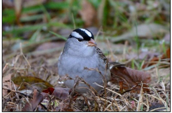
Adult White-crowned Sparrow, 27 Oct 2018, Valle Crucis Community Park, Watauga County.