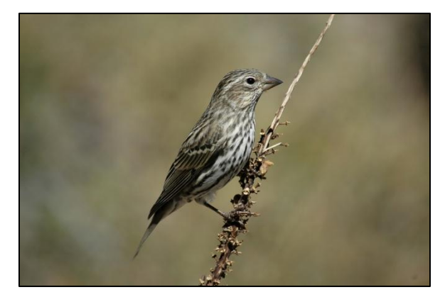
This "normal" female or hatch-year male Cassin's Finch was photographed at the same location as the aberrant bird.

Aberrant plumage can confound experienced observers. I once had a friend who asked me for help in identifying an odd bird in his yard. The man was familiar with all of the common birds on his property, and he was a careful observer. He described the bird as looking like a white American Robin... it was the same size and general shape as a robin. I suggested to him that his mystery bird was in fact most likely an albino or leucistic American Robin, but he dismissed this suggestion by saying "I know what a robin looks like and this is not a robin. Several weeks passed, and when I saw him again, he said "Well, you were right. It was a white robin." He had studied the bird and convinced himself.