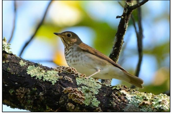
Swainson's Thrush, 7 Oct 2018, Tanawha Trail at Holloway Mountain Road, Watauga.