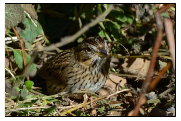
Lincoln's Sparrow, 4 Nov 2018, Westbrook, Boone, Watauga County.