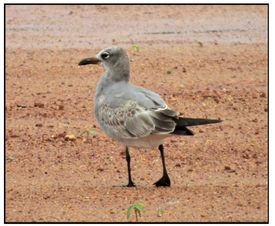
Laughing Gull, 17 September 2018, Boone Greenway Optimist Club Baseball Field, Watauga County.

Common Loon, an apparent first year bird continued from the summer at PRICE and was last reported 4 Oct