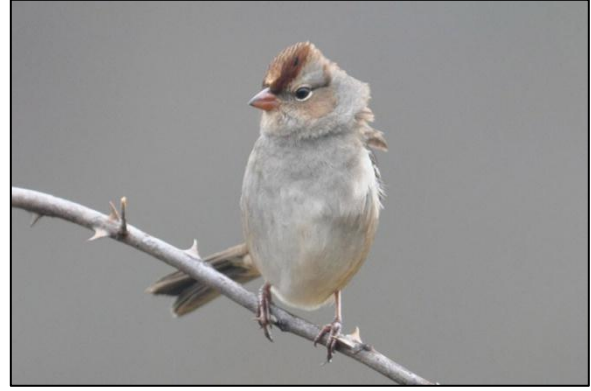
Immature White-crowned Sparrow, 13 November 2018, Valle Crucis Community Park, Watauga County.