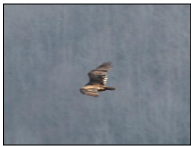
Turkey Vulture at the Stone Mountain CBC on 30 December 2018.

December 16th- Roan Mountain: More rain and high winds kept the birds down in the Roan Mountain area which includes parts of Avery County. A flock of 7 AMERICAN BLACK DUCKS was a good find, and the species count of 47 was just above the norm.