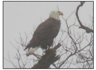
Adult Bald Eagle at the New River CBC on 4 January 2019.

The one thing that all our counts had in common this year was low numbers! Overall, the number of birds found was about ¾ of what we usually find. We will keep an eye on this and hope it's a blip, not a trend. Everyone can help by keeping brush piles and thickets of vegetation, mowing less, and setting aside space for nature.