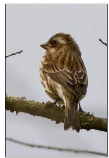
Purple Finch, 27 October 2018, Valle Crucis Community Park, Watauga County.