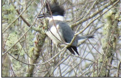
Belted Kingfisher at the Shady Valley/ Mountain City CBC on 1 January 2019.

January 1st- Shady Valley/Mountain City: Mild, partly sunny conditions allowed comfortable birding, but again bird numbers were low, and the species count of 58 was a little low. A BALD EAGLE was found, first time ever for the count, consistent with the growing population of the species for the area as a whole. In the Neva community of Johnson Co., Tennessee, close to the NC border in Watauga Co., a LOGGERHEAD SHRIKE surprised us by jumping up on a low Christmas tree in great lighting among a bunch of mature WHITE-CROWNED SPARROWS.