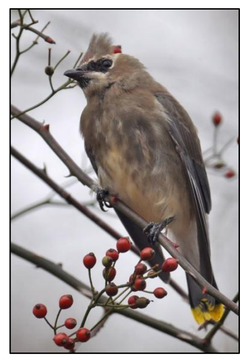
Immature Cedar Waxwing, 14 November 2018, Valle Crucis Community Park, Watauga County.