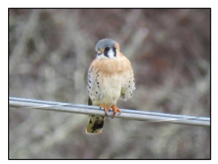
American Kestrel at the Shady Valley/ Mountain City CBC on 1 January 2019.

December 30th- Stone Mountain: Warm and sunny conditions made the birding very pleasant but numbers were still well off long-term averages. A large group of soaring VULTURES, both BLACKS and TURKEYS, entertained a group of HCAS birders near sunset on top of Stone Mountain. On the way out of the park afterwards, we were treated to very close looks at an adult SHARP-SHINNED HAWK, then nice looks at several Red Bats which were taking advantage of the warm conditions to hunt flying insects just before sunset.