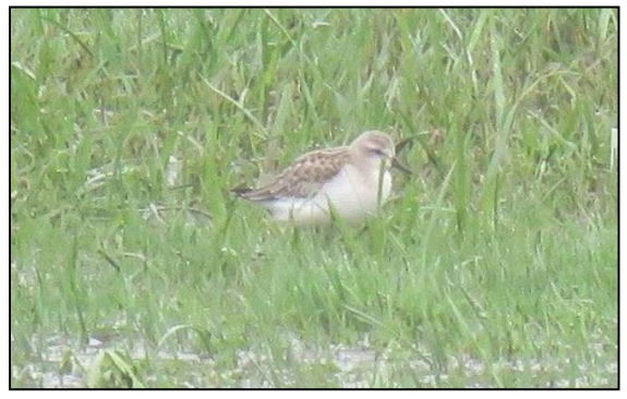
Semipalmated Sandpiper, 17 September 2018, Boone Greenway - ASU Athletic Fields, Watauga County.

Great Egret , BROOKSHIRE on 5 Nov-- count of 5 was unusually high and very late; also one at HICKKNOLL on 6 Nov. Both were part of a wave