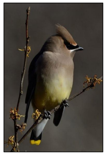
Cedar Waxwing, 21 November 2018, Julian Price Memorial Park, Watauga County.