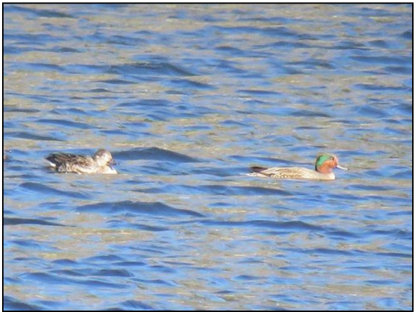
Green-winged Teal, 4 November 2018, Price Lake, Watauga County.

The most notable thing about this fall was the lateness of the migration. Many new latest fall dates were set for migrating species. New late warbler reports included Black-throated Green, Tennessee, Canada, and Magnolia. Swainson's Thrush also set a late date. This fall's very warm conditions over much of eastern North America likely had an impact on these birds.